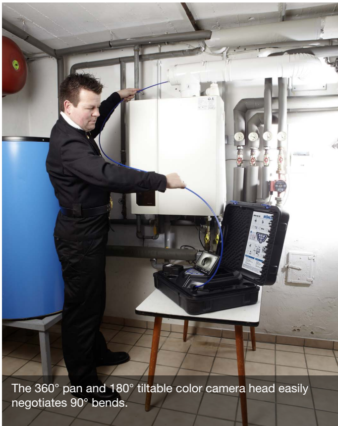
The 360° pan and 180° tiltable color camera head easily negotiates 90° bends.