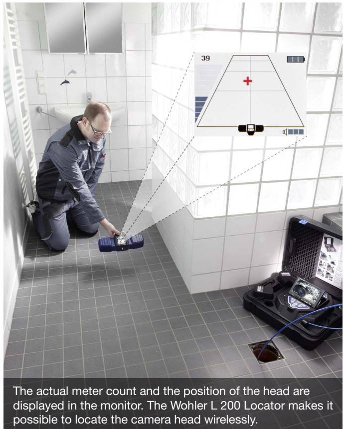
The actual meter count and the position of the head are displayed in the monitor. The Wohler L 200 Locator makes it possible to locate the camera head wirelessly.