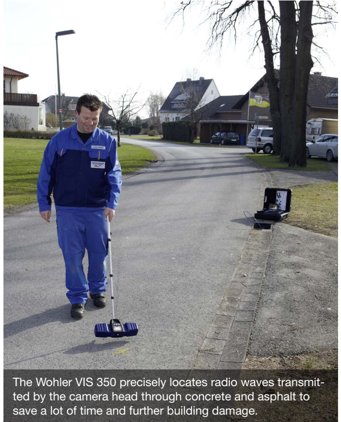
The Wohler VIS 350 precisely locates radio waves transmitted by the camera head through concrete and asphalt to save a lot of time and further building damage.